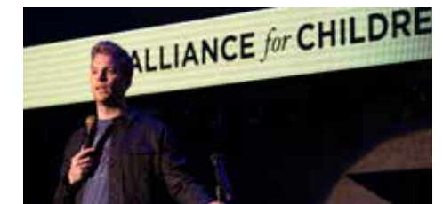
Anthony Jeselnik on stage at 2016 RIGHT to LAUGH

The Alliance’s night of comedy and cocktails has raised nearly $2 million and featured some of the best in comedy including Jimmy Kimmel, Tig Notaro, Martin Short, Sarah Silverman and Bob Odenkirk. Join us in laughter for a great cause this fall.