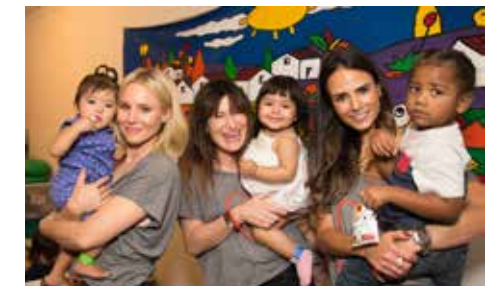
Kristen Bell, Kathryn Hahn, and Jordana Brewster in the playroom at Raising Baby.

Raising Baby is the flagship event of the Alliance of Moms. This day of interactive workshops focuses on educating expecting and parenting youth about early brain development and child-rearing. The event provides access to a variety of resources through partner organizations including Children’s Institute, Project Fatherhood, Loom, Too Small to Fail, and others.